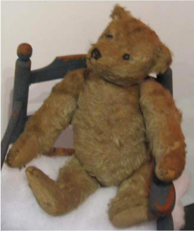
A Well-loved Teddy Bear on Display

Christmas is a time of wonder and excitement for children and the latest exhibit at the Gunn Historical Museum evokes those memories in an inspired way.