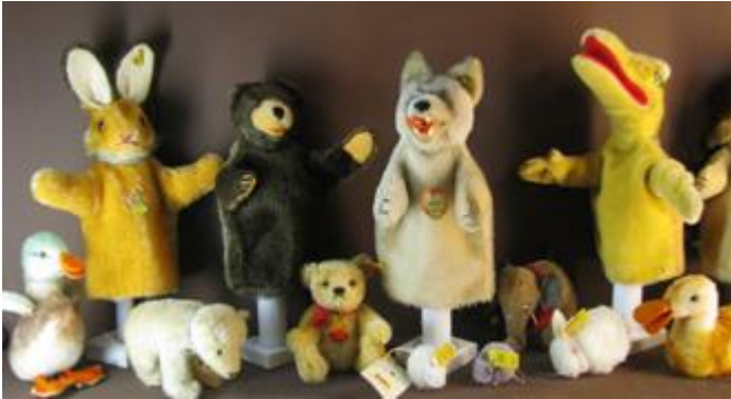
Steiff Hand Puppets