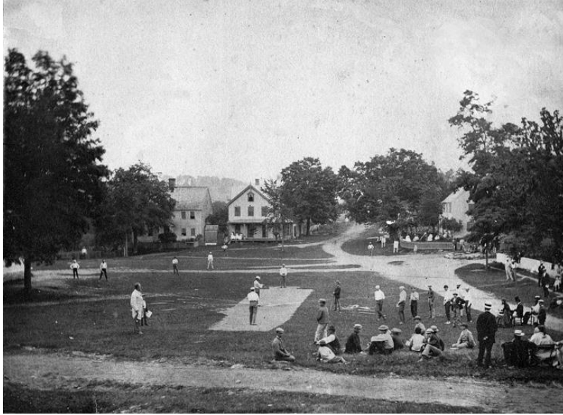
The Gunnery Reunion Game on Washington Green, August 4, 1869.